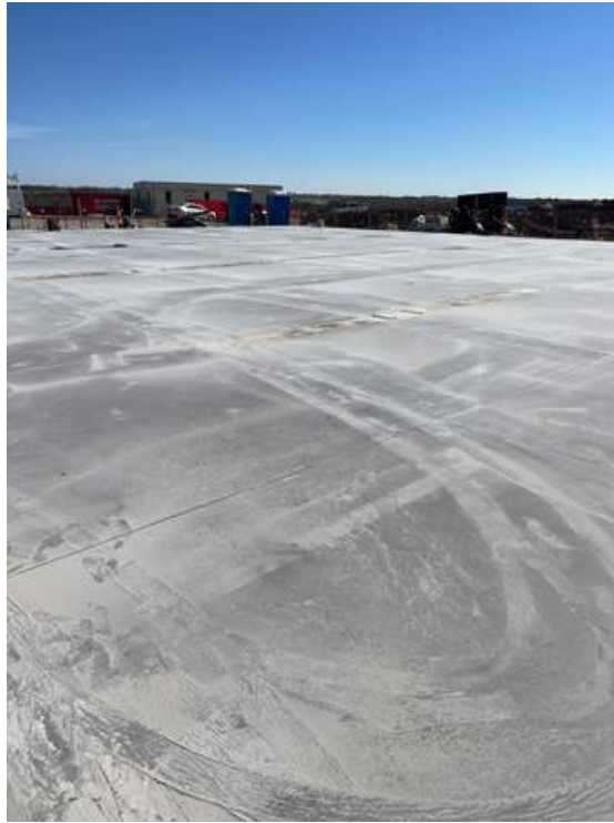
Drone Photo Overall Site Progress